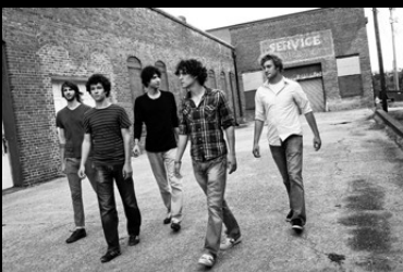
The Bent Strings

This young group from Greenville, SC wows crowds with a unique blend of progressive folk rock, jazz, and americana. Influenced by groups such as Nickel Creek, Bela Fleck and the Flecktones, Acoustic Syndicate and The Strokes, The Bent Strings launch out where these groups leave off, offering audiences tight and energetic covers and fresh originals.