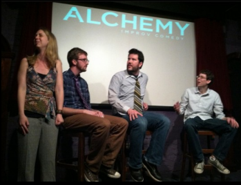
Alchemy Improv Comedy